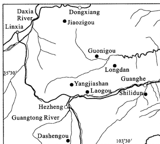
Fig. 1. Representative fossil localities of the Cenozoic in the Linxia Basin.

Lanzhou Basin adjacent to the Linxia Basin (Qiu and Wang, 1999). Schizotherium was also a characteristic Oligocene form in China, and it was found from the Oligocene Nanpoting Fauna in the Lanzhou Basin (Qiu et al., 1998). Aprotodon was previously found only from Pakistan, Kazakhstan, and the Lanzhou Basin, and it coexisted with the giant rhinoceros in these three regions (Qiu and Xie, 1997) like in the Jiaozigou Formation of the Linxia Basin. Ronzotherium was found only in the Oligocene of Eurasia (Heissig, 1969). The entelodont was the most diversified during the Sannoisian and the early-middle Stampian Ages, and Paraentelodon macrognathus was very abundant in the Jiaozigou Fauna. Tsaganomys appeared first in the late Early Oligocene, and its assured record ended in the early Late Oligocene. As a result, Tsaganomys is one of the index fossils for the Asian Oligocene (Wang, 2001). Tsaganomys was found from the Oligocene Nanpoting Fauna in the Lanzhou Basin.