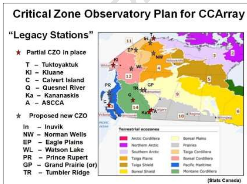
Figure 2. Planned Critical Zone Observatories for Canada as a component of the planned pan-Canadian EON-ROSE research initiative.